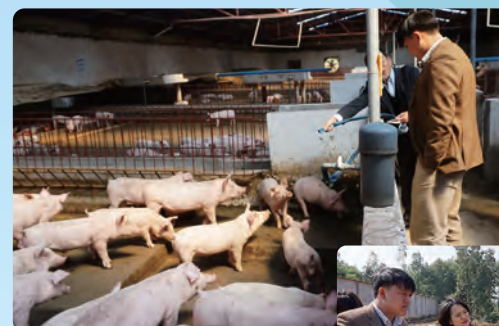
Pilot Action Programme in Viet Nam: Research to apply cleaner production in pig farming

● Bilateral meetings are occasionally organised for finding clue for solutions from intensive discussion between two countries – the one country which wants to address a specific issue and another to have experiences to address the issue.