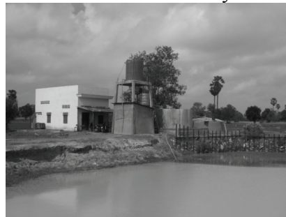
Water Treatment System