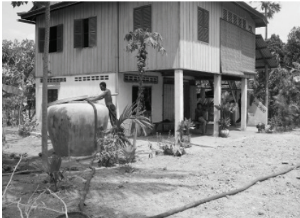
Collection from Roof and Vendor