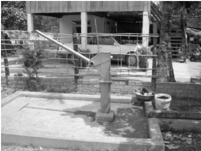
Ground Water from a Hand Pump