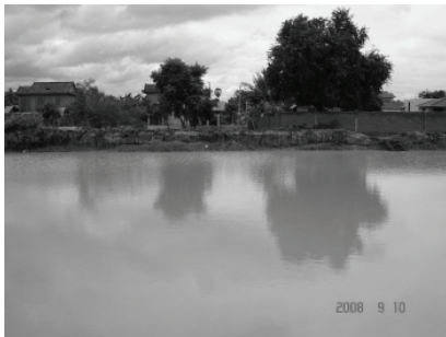
New Rainwater Harvesting Pond