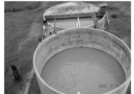
C.F.S. Tank and Slow Sand Filter