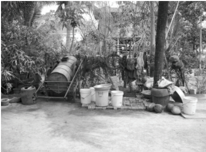
Brought by Cart from the Pond