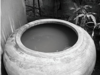
Harvested Rainwater in Jar