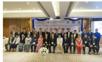
Preparation Workshop on the Asia Wastewater Management Partnership (AWaP) 13 December 2017 Yangon, Myanmar