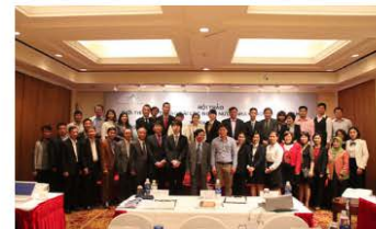
Workshop for Introduction of Multistage Hybrid Wetland Systems in Vietnam 30 November 2017 Hanoi, Vietnam