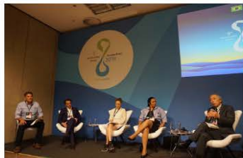
The 8th World Water Forum – Sharing Water 18th - 23rd March, 2018 Brasilia, Brazil