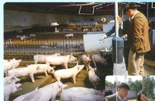
Pilot Action Programme in Viet Nam: Research to apply cleaner production in pig farming

● Bilateral meetings are occasionally organised for finding clue for solutions from intensive discussion between two countries – the one country which wants to address a specific issue and another to have experiences to address the issue.