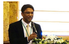
WEPA session at 12th International Symposium on Southeast Asian Water Environment (SEAW12) 29 November 2016, Hanoi, Viet Nam