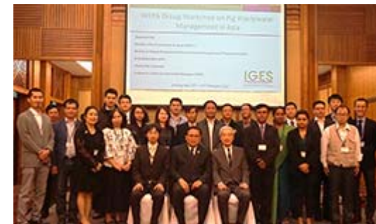
WEPA Group Workshop on Pig Wastewater Management in Asia