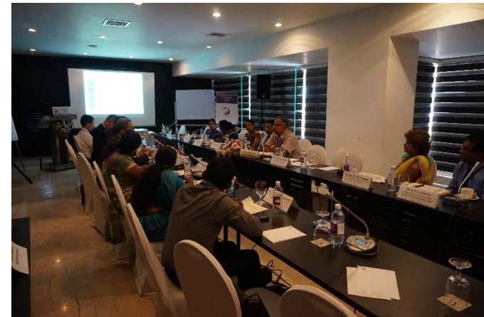
Consultation Meeting in Colombo

Detail of the program will be explained by Sri Lanka later