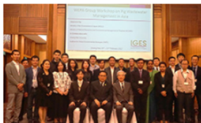
WEPA Group Workshop on Pig Wastewater Management in Asia 21 February 2017, Chiang Mai, Thailand