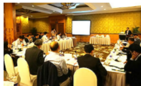
The 12th Annual Meeting 30 November 2016, Hanoi, Viet Nam